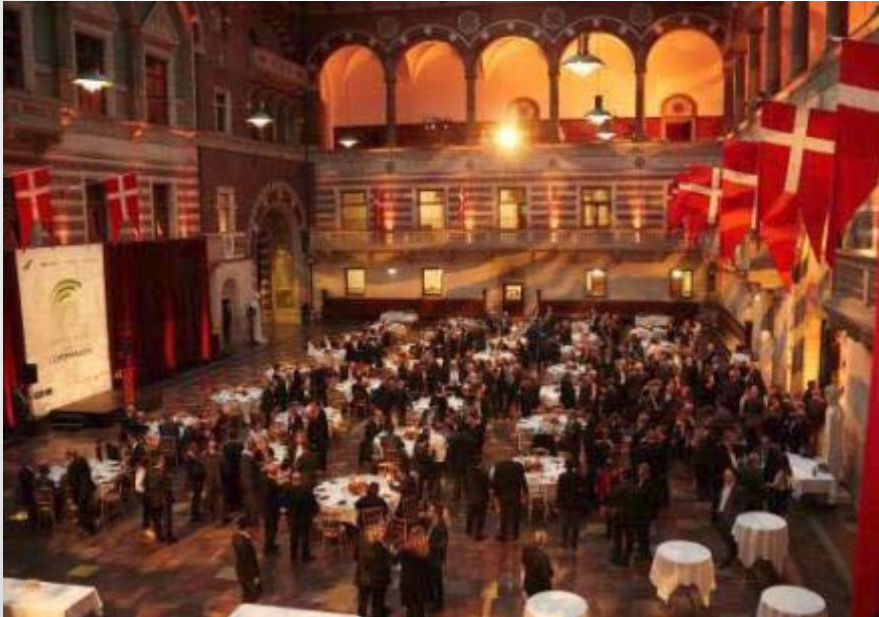
VIP Dinner @ City Hall